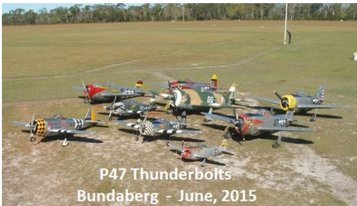
P47 Thunderbolts Bundaberg - June, 2015

(/uploads/2/4/4/5/24455598/2977326_orig.jpg?726)