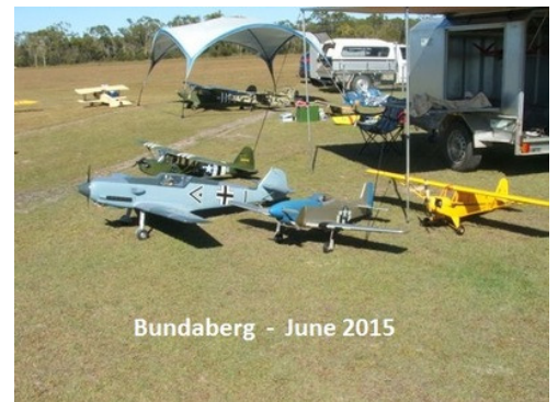
Bundaberg - June 2015