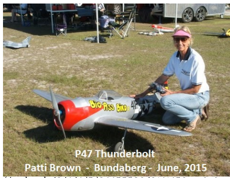
P47 Thunderbolt Patti Brown - Bundaberg - June, 2015 (/uploads/2/4/4/5/24455598/8141458_orig.jpg)