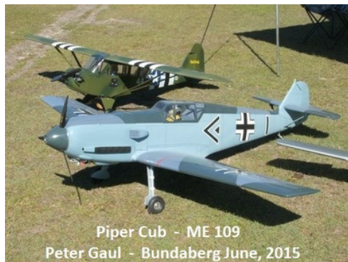
Piper Cub - ME 109 Peter Gaul - Bundaberg June, 2015