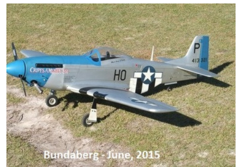
Bundaberg - June, 2015