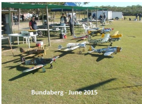
Bundaberg - June 2015

Click on the photos below to view full shots and the slideshow.