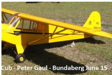
Cub - Peter Gaul - Bundaberg June 15