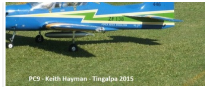
PC9 - Keith Hayman - Tingalpa 2015