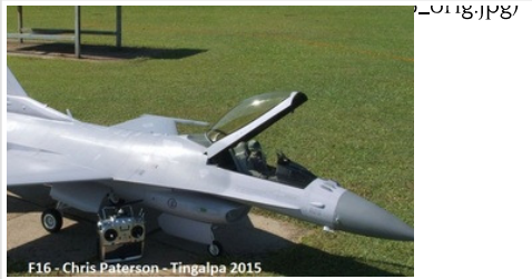
F16 - Chris Paterson - Tingalpa 2015