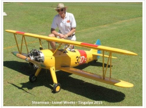
Stearman - Lionel Weeks - Tingalpa 2015